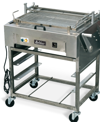
HI18F (With Donut Tray Closed)