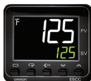
Electronic Temperature Controller