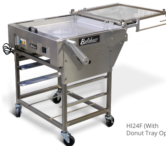
HI24F (With Donut Tray Open)